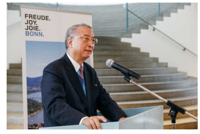
Zhang Xinsheng, President of the International Union for Conservation of Nature, during the Opening Reception hosted by the City of Bonn

Though long-term financing for local and subnational governments is theoretically available (through the direct access modality of the Adaptation Fund, for example), access to the available pot remains a challenge. The CitiesIPCC Cities and Climate Change Science Conference highlighted that access could be