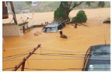
Mudslides in Sierra Leone mark the deadliest event of the year.