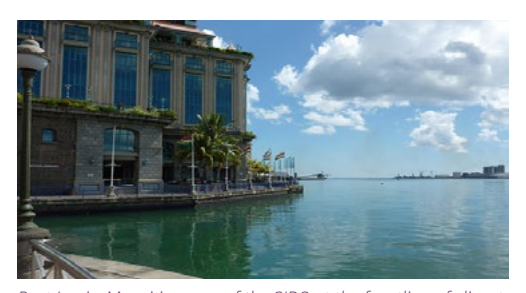
Port Louis, Mauritius, one of the SIDS at the frontline of climate change @ By garybembridge

Financing for adaptation projects of the scale necessary is lacking, making international help inevitable. For example, Fiji would need USD 4.5 billion to fund climate change adaptation measures - an amount close to the country's annual GDP. The Fijian government to some extent has overcome such restraint by issuing sovereign green bonds to support adaptation projects (World Bank, 2017). The small island nation also raised international awareness of the immediate threats and needs of SIDS during its COP23 Presidency, where the Talonoa Dialogue was born (see page 7). At COP23, ICLEI and the Global Island Partnership (GLISPA) established the Frontline Cities and Islands, a movement of mayors and leaders of island economies who commit to advance local action to deliver scalable, integrated solutions to build resilience. Currently, through the Frontline initiative, ICLEI and GLISPA jointly support local governments' capacity building for resilience, by offering risk assessment tools and facilitating multistakeholder Disaster Risk Reduction (DRR) workshops based on the Sendai Framework for Disaster Risk Reduction. The Frontline initiative also supports local governments to develop joint work programs and share solutions and develop innovative financing mechanisms.