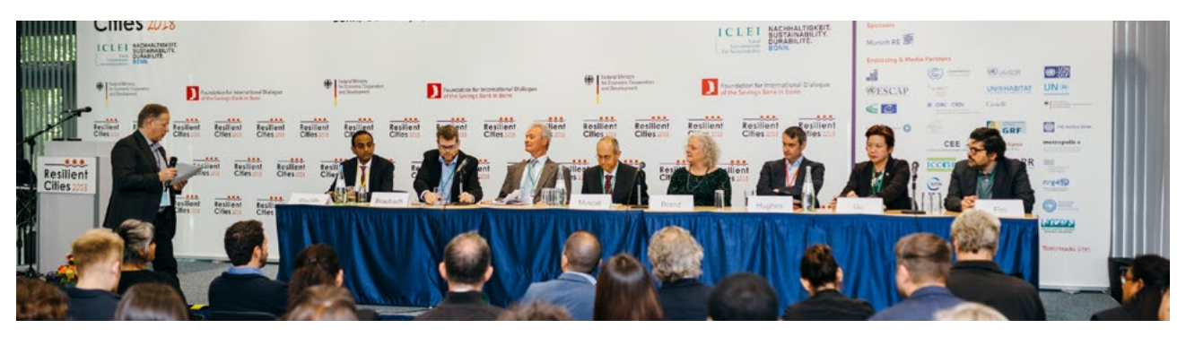
Resilient Cities 2018's special sub-plenary "Driving transformative climate change adaptation in cities through nature-based solutions"

In the meantime, greening fiscal policies could open doors for innovative financing mechanisms for NbS. Stuttgart, Germany for example, has introduced tax incentives and tailored financial programs to complete its green roof expansion strategy (ICLEI, TNC, 2017). Pooling efforts with multiple local governments might also prove helpful, as increasingly large scale donors like the European Union encourage cities to work together to receive substantial financial support for integrated sustainability projects. Lastly, providing incentives for cities and citizens could support the business case for NbS and bring about the necessary mentality switch away from relying on finite resources toward utilizing the existing natural and replenishable arsenal at cities' disposal to achieve sustainable urban development.