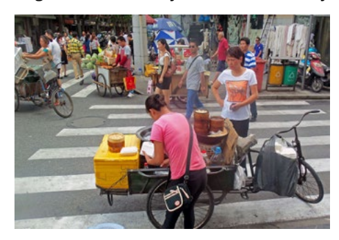
A woman preparing and selling hot food from the back of her bicycle in Shanghai.

Food and Agriculture Organization of the United Nations (FAO) in collaboration with RUAF Foundation implemented a city-region food system assessment in <u>Lusaka, Zambia</u>. According to the assessment, 60% of the food consumed in Lusaka comes from the city region, which provides the main commodities consumed by the urban population (fruits, vegetables, livestock, dairy products, and fish). Despite that, there is no single existing institution mandated to govern the food system within the city region and the current fragmented governing bodies scarcely collaborate.