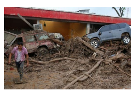
The consequences of the landslide in Mocoa, Colombia.