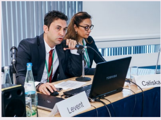
Delegation from Istanbul Metropolitan Municipality presenting the pilot Urban Transformation Project in Bayrampaşa District

In subsequent years, the city developed detailed hazard maps, launched several micro-zonation projects, conducted loss and damage analysis, and applied the megacity indicator system for disaster risk management (MegalST) for assessing its physical risks in a holistic way (Menteşe et. al., 2015). As a result of these efforts, the metropolis has emerged as a pioneer in earthquake mitigation by acknowledging the constant and inherent risk of Istanbul landscape. its geological position and by taking determined steps to avoid a large-scale catastrophe while focusing on the well-being and priorities of its citizens.