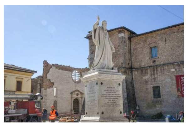
Norcia, Italy: aftermath of a 6.5 magnitude earthquake, which destroyed invaluable historical heritage.

At Resilient Cities 2018, local governments explained how they actively engaged with citizens to boost their feeling of identity towards the city and ownership of its cultural and historical wealth, while at the same time creating economic opportunities and taking measures to enhance urban resilience without altering characteristic areas. For instance, Guimarães, Portugal presented its best practices that led the municipality to become the European Union Capital of Culture in 2012, EU City of Sport in 2013 and the most sustainable city in Portugal in 2017. Guimarães credits its success to its engaged "eco-citizens", citizens who are proud of their municipality, culture and heritage. Similarly, Bologna, Italy displayed its installation of temporary green areas, such as overhead