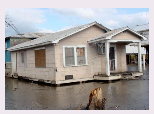
The aftermath of a hurricane in Isle de Jean Charles, Louisiana

The Louisiana Office of Community Development – Disaster Recovery Unit (OCD-DRU) is currently leading the efforts to mitigate the impacts of climate change and plan for a managed "retreat with dignity" and community consensus. With a grant of USD 92.6 million awarded by the U.S. Department of Housing and Urban Development, the OCD-DRU is implementing two projects: Louisiana's Strategic Adaptations for Future Environments (LA SAFE) and the resettlement plan for the Isle de Jean Charles, the first publicly-funded, climate change-induced resettlement project in US American history.